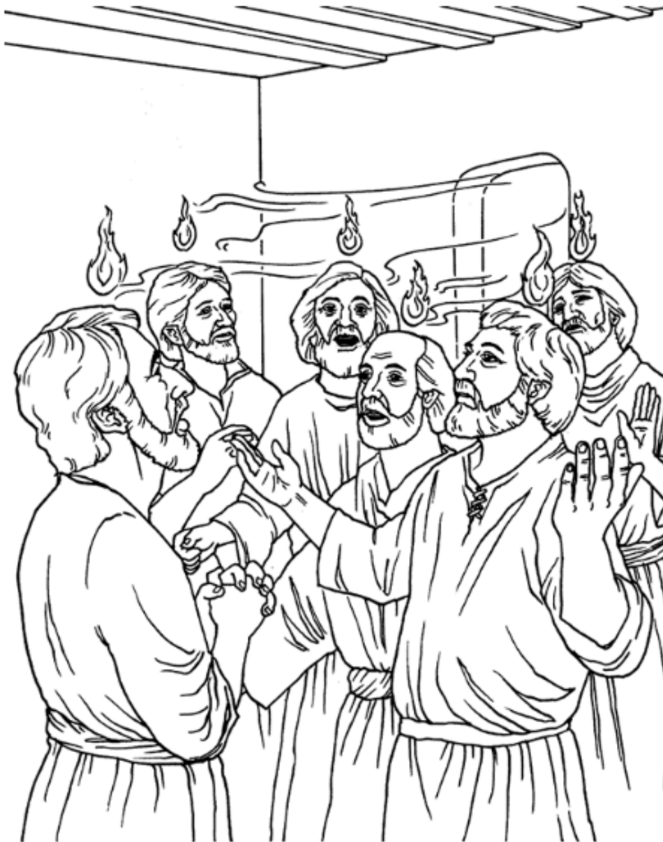
The Day of Pentecost Acts 2